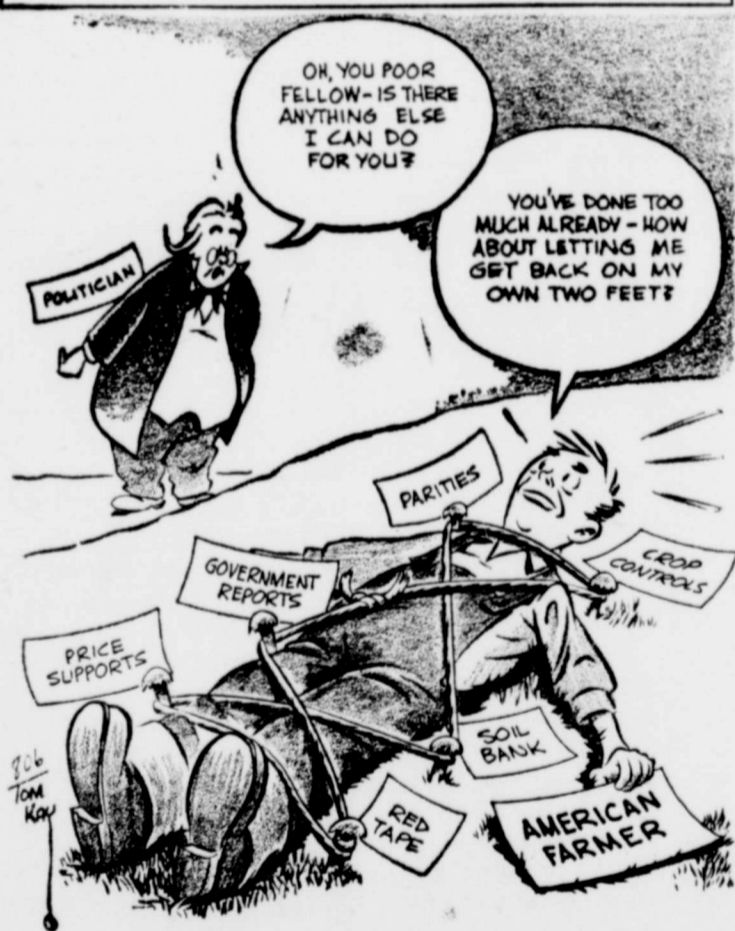
Relief Needed — From Politicians!