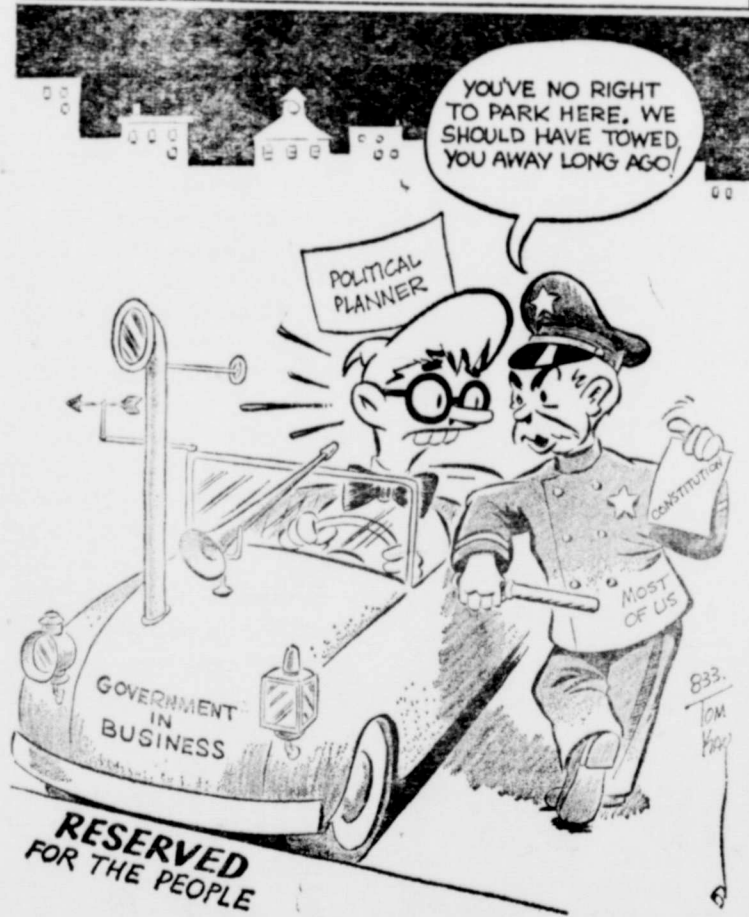
The Law Breaker