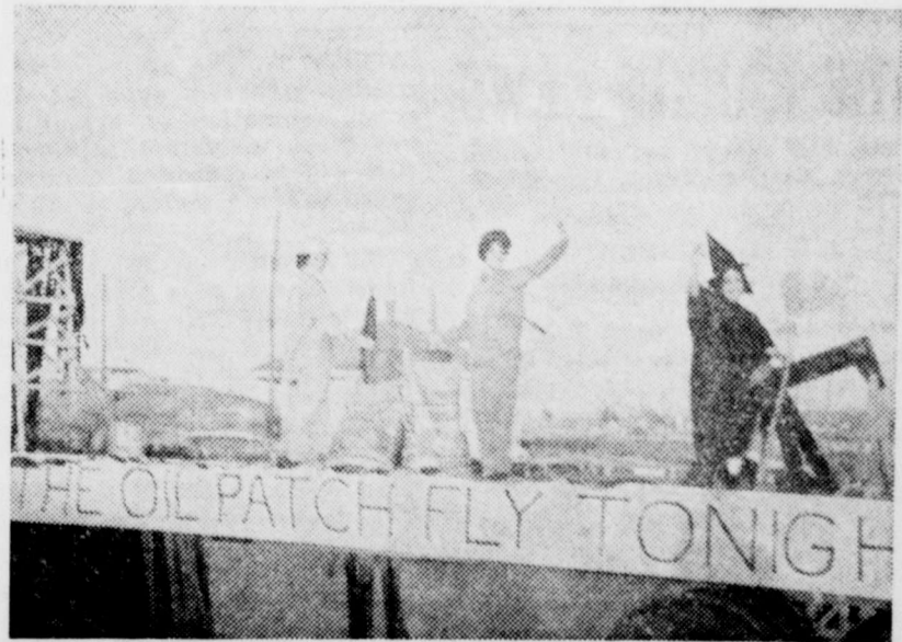
HALLIBURTON WOMEN'S CLUB ENTRY Second Place Winner