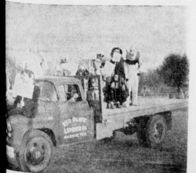
MICRON TAU, BETA SIGMA PHI ENTRY (See list of Winners on Center Section)

No. 9. Salary by Legislature, 126 for and 200 against. No. 10. 4- year Terms for Representatives, 101 for and 220 against.