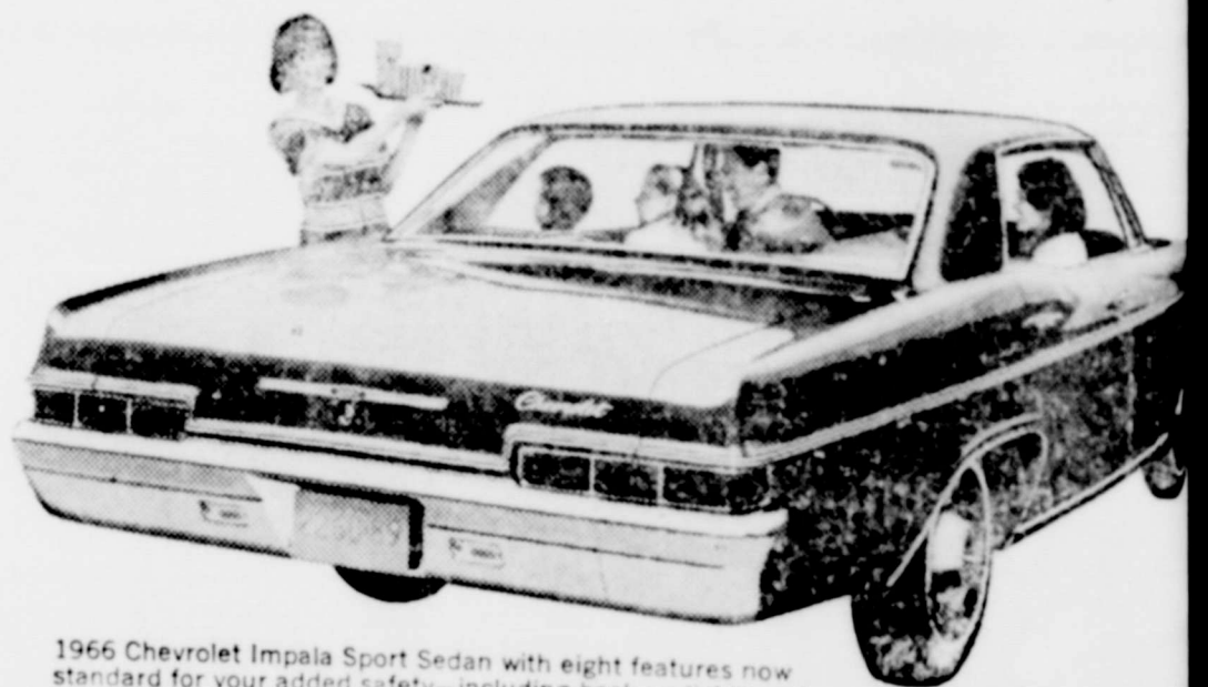
1966 Chevrolet Impala Sport Sedan with eight features now standard for your added safety—including back-up lights and seat belts front and rear (always buckle up!).

What you get is • The meticulous coachwork of Body by Fisher that surrounds you with rich appointments, deep-twist carpeting • Full Coil suspension that uncrinkles roads • Magic-Mirror finish • Gobs of room for hips, legs and feet.