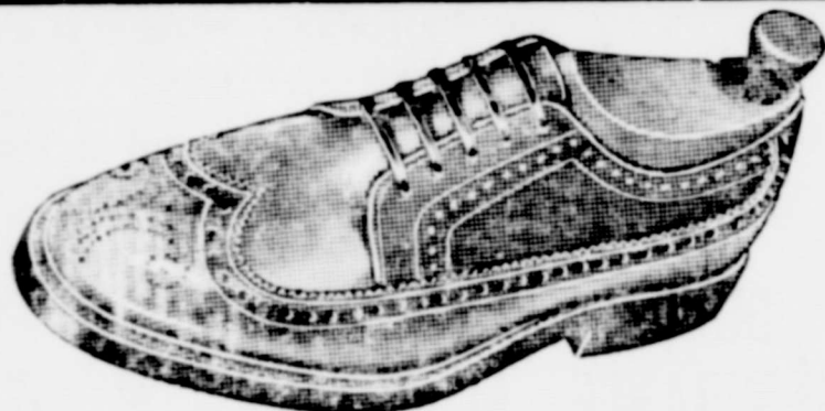
THE "VIKING" WING TIE BY CITY CLUB COFFEE BROWN (HAND STAINED)

EACH SUNDAY Elizabeth & 8th Sts. Sunday School: 9:30 a.m. Worship Service: 10:30 a.m.