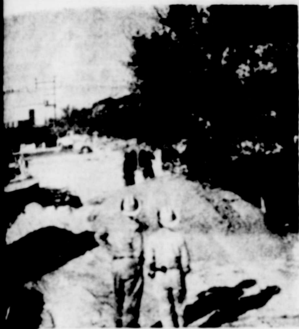
THE FIRST new business structures to get in Rankin in several months is the new building on Main Street. Workmen level the floor.

Fans are reminded to keep in mind the dates of December 2-3, the Rankin Boys Invitational tournament.