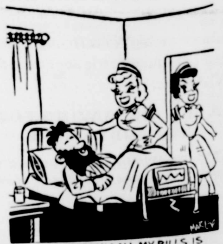
AN' JUST THINK ALL MY BILLS IS BEIN' PAID BY

MARKING PENS. DO stamps, cloth mark stamp pads of all at The News Office