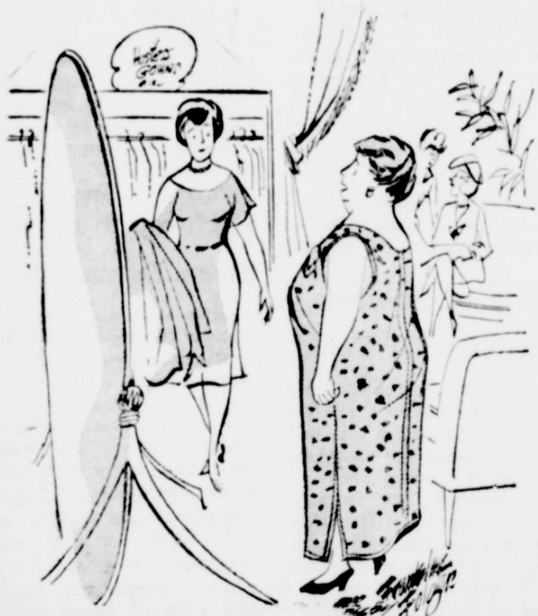
"On me the gently flowing lines always turn into a flood."