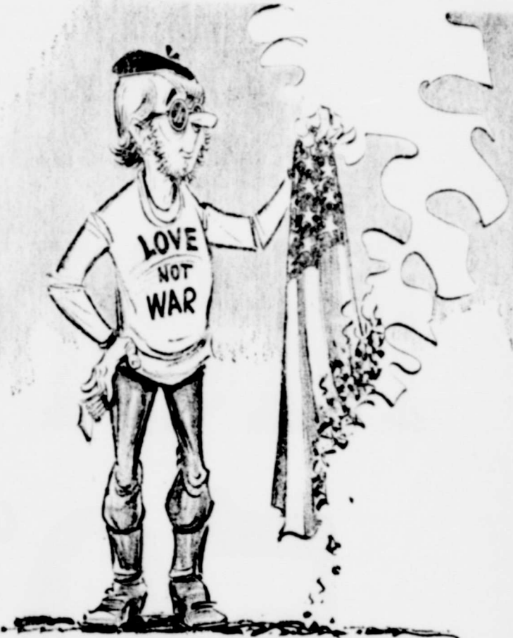
STUDY IN IGNORANCE