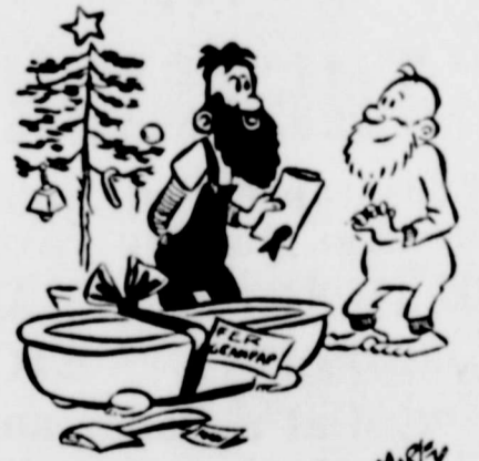
HYARS A BATHTUB FER YE GRANPA AN'A POLICY AGIN' DROWNIN' WITH

MATTRESSES—New or Rebuilt: Made by Western Mattress, San Angelo. They are guaranteed. Pickup, delivery, sales and service. Call Turner Motel, leave name, Ph. MY 3.2274.