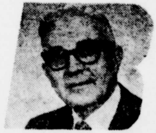
"YOUR DEMOCRATIC NOMINEE"