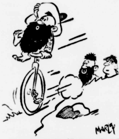
LIL' LONZO'S GOIN' TO TOWN TO GIT INSURANCE ON HIS BIKE WITH

EACH SUNDAY Sunday School: 9:45 a.m. Worship Service: 11 a.m. Elizabeth & 8th Sts.