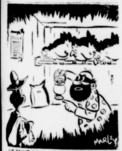
WE CAN'T STEAL TH' MECOY'S CHICKENS THEY HAVE A POLICY WITH