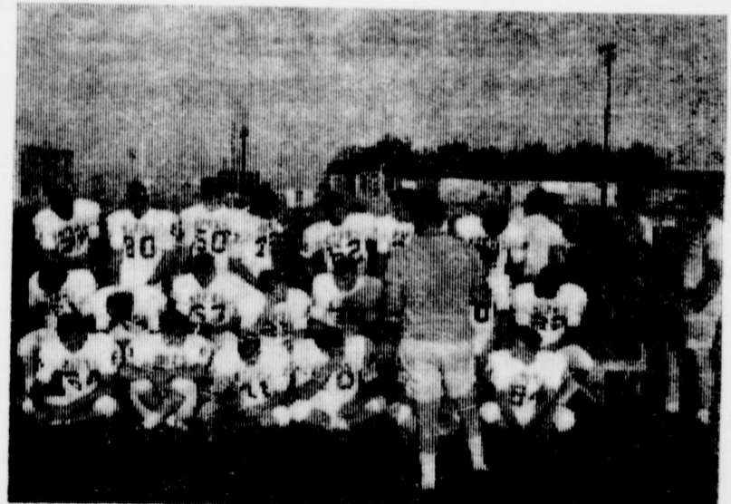
THE EASY PART'S OVER — Monday morning was picture-tak- ing day in the Red Devil football training camp—and one of the last times that the squad was "at ease."

And ole Frank is fit to be tied— nerves, you know.