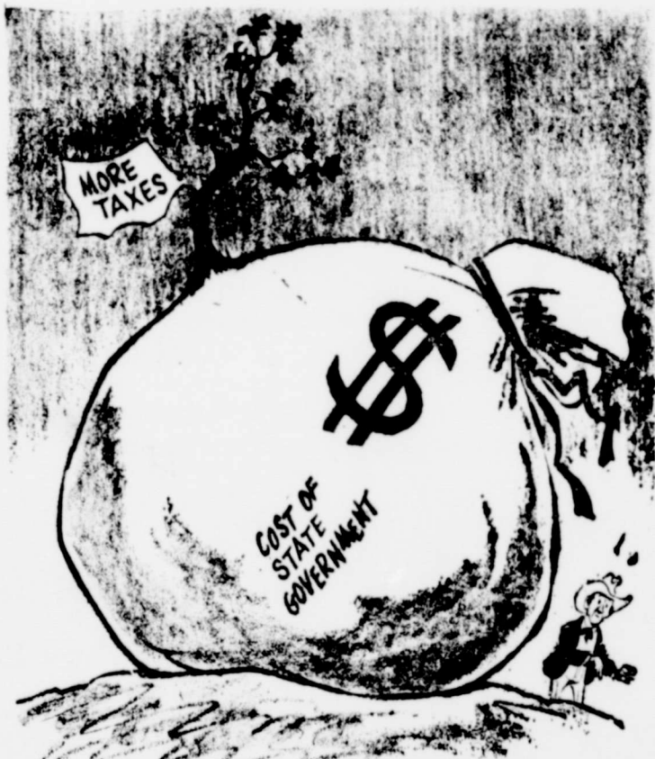
A TREE GROWS IN TEXAS