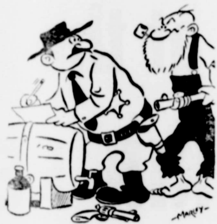
AWRIGHT REVENOGER AHM GONNA LET YUH APPLY FER INSURANCE WITH...

WEST TEXAS UTILITIES AN INVESTOR OWNED ELECTRIC COMPANY Equal Opportunity Employer