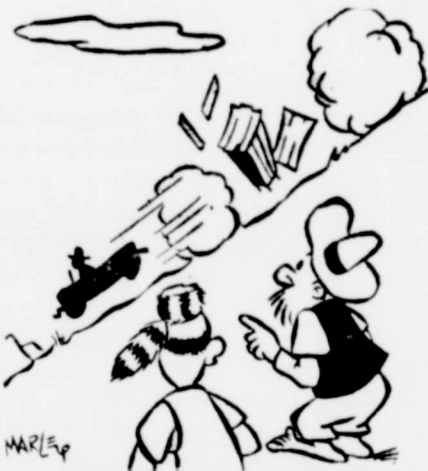
ZEB IS RUSHIN' DOWN TA' GIT HIS NEW CAR PERFECTED WITH