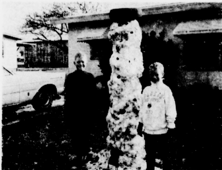
King size, no filter