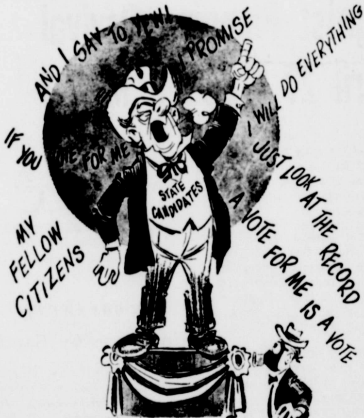
ANOTHER TYPE OF POLLUTION