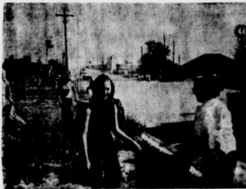
Tote That Bag