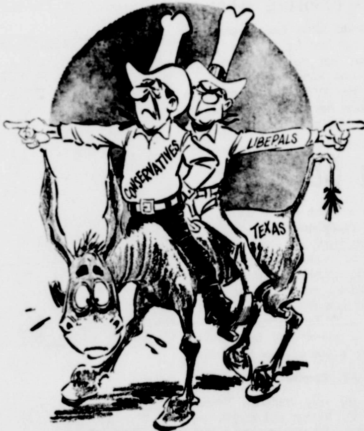
SUDDENLY IT'S PRIMARY TIME