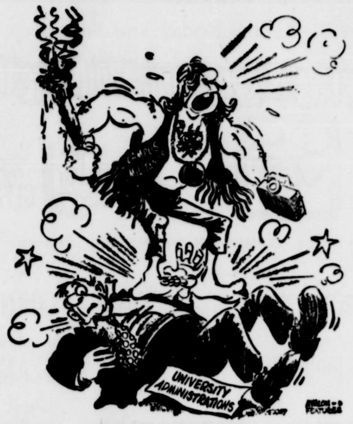
"WHAT EVER HAPPENED TO THE PRACTICE OF EXPULSION?"