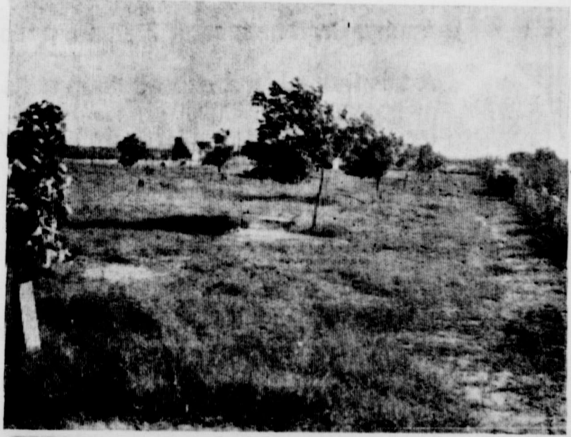
A small tract with large trees--though only four years old-- is owned by S. O. Langford just to the south of Rankin Draw. Plans call for a small-scale commercial operation.