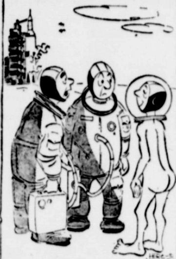
"YOU GOT SOME INSIDE POOP ON THE TEMPERATURE OF THE MOON THAT WE DON'T HAVE?"