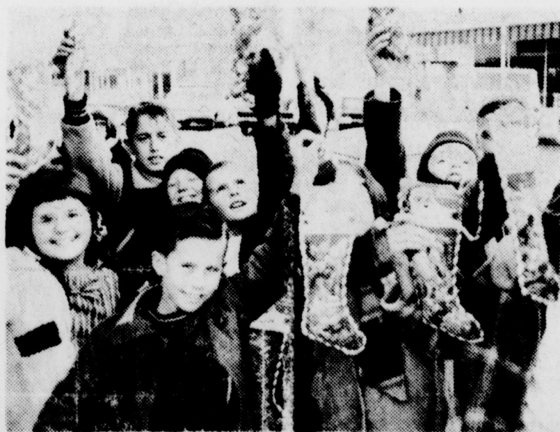
Fun at a Lions Club Christmas Party