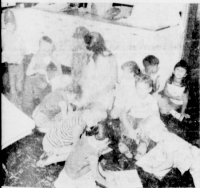
Turning the Crank