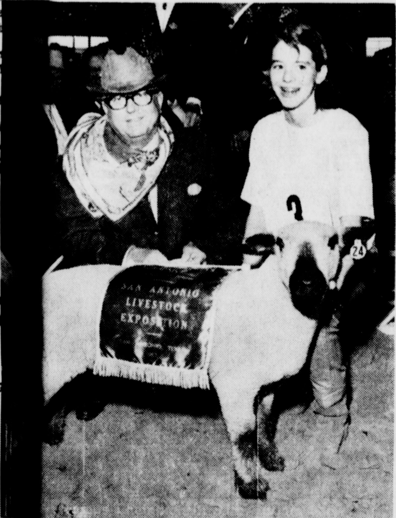
A previous Champion in San Antonio Show

In their last game, in Sanderson they marked up a 47-30 win with Page as high point with 25 and Gossett the top rebounder at 9.