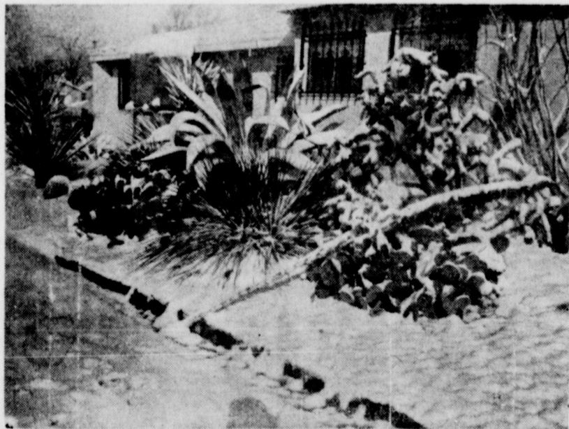
IT'S PRETTY STUFF when properly displayed, as in the cactus garden at the Doc Gossett residence. Picture was taken following the Feb. 7th winterizer.

Oddly enough, however, Rankin has escaped much of the frozen icy street conditions that have plagued the Odessa-Midland area several times this winter.