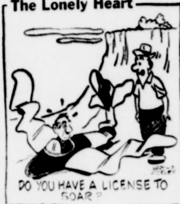
The Lonely Heart