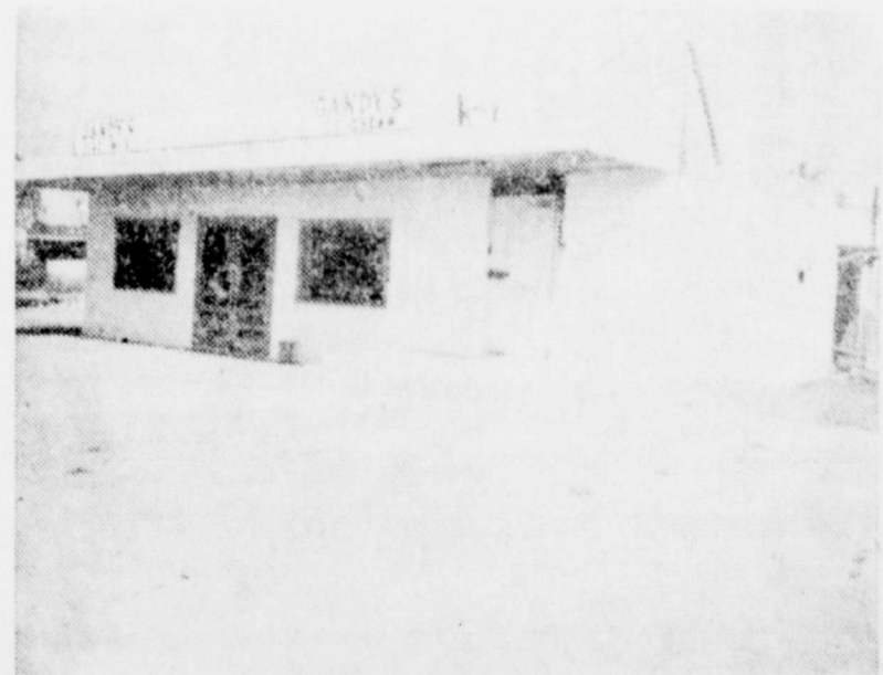
Rankin Drive-In Grocery

For the Rankin News, there will be no newspaper published next week. Traditionally, the News skips the issues falling on the week of July 4th and January 1st, for vacation purposes. Offices of the News will close at 4 p.m. Friday, June 28 and re-open at 7 a.m., Monday, July 8.