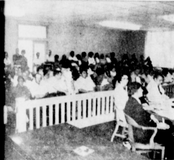
Standing Room Only as Court Opened on Monday