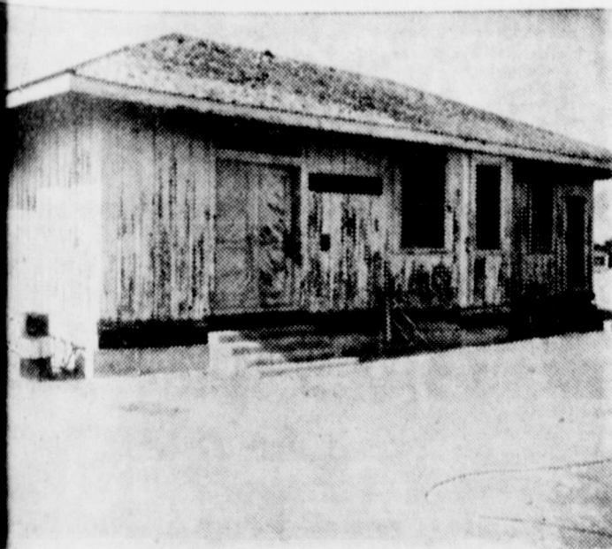
Old Santa Fe Trail

Rankin Hospital's Board of Directors have completed work on their proposed operating budget for the District for 1974-1975 fiscal year. They have set a public hearing for 8:00 p.m., Tuesday, July 9 in the conference room at the hospital. All interested persons are invited to be on hand and to examine and comment on the proposed expenditures.