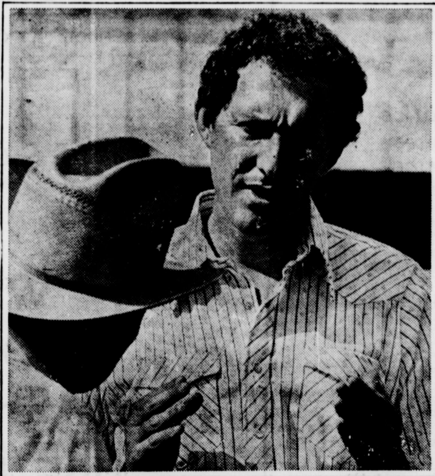
A man who cares about America.