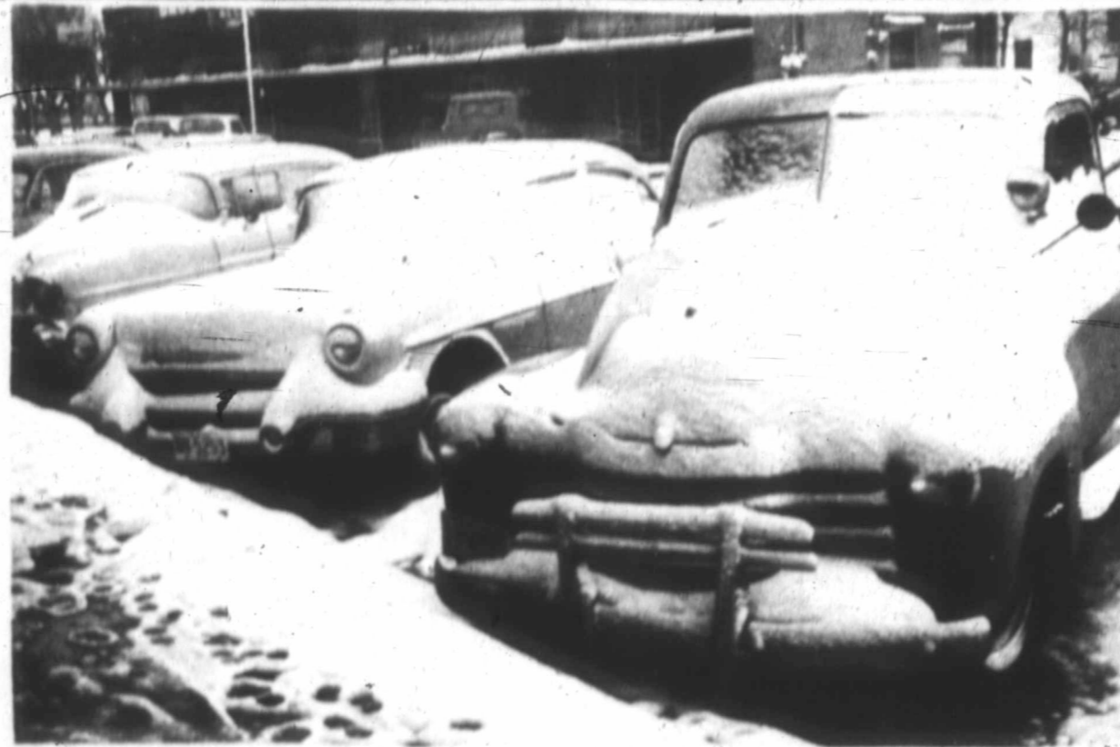
MERINGUE — The weather put a white top on these cars parked on the streets of Sudan, as more than three inches of snow fell Monday and Tuesday. The snow was welcomed by farmers who badly needed the moisture on their cropland.