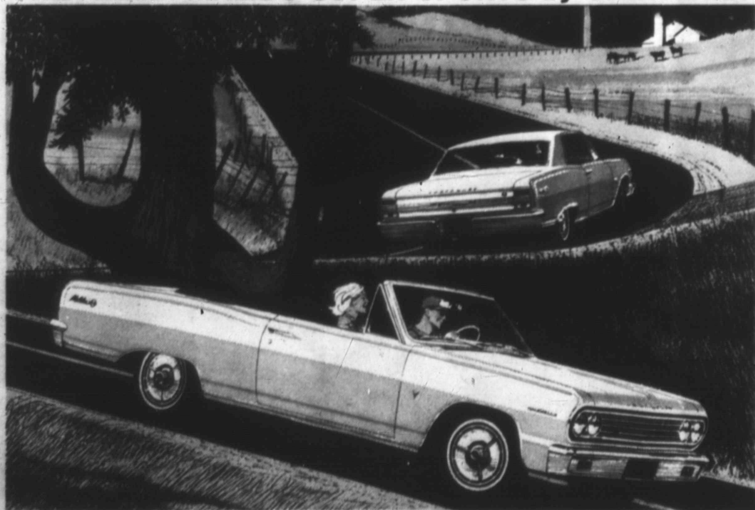
Background, new Chevrolet Malibu Super Sport Coupe; foreground, Chevrolet Malibu Super Sport Convertible.