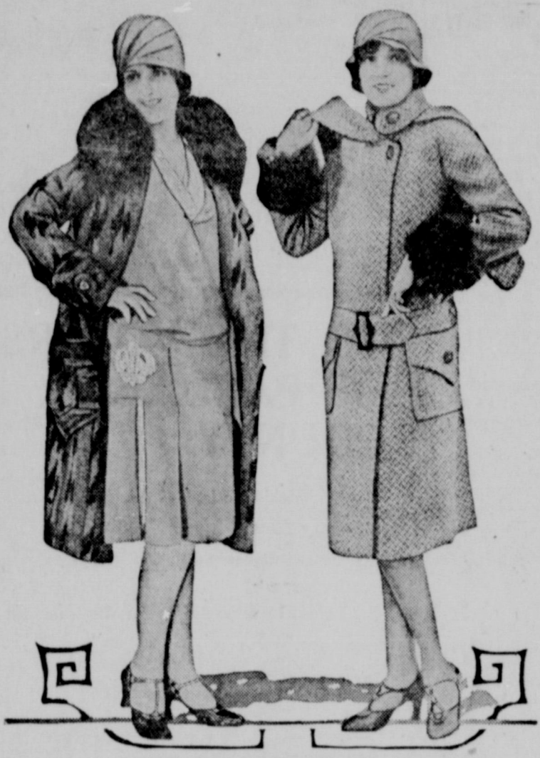
TWO CHARMING COATS

At least one, if not several of these and breadth of styldom this season. | matching chapeaux, is sure to be The strange and fascinating part of either of hatter's plush or soleli. It is that no two tweeds look alike. Without detracting from the glory of There's a different tweed to greet the either the felt or the velvet bat, for eye at every turn-that is, if you are their vogue is unquestioned, hatter's hobnobbing with the smart set, which plush and similar long-nap fabrics at this time of the year throngs the carry the honors of being the really