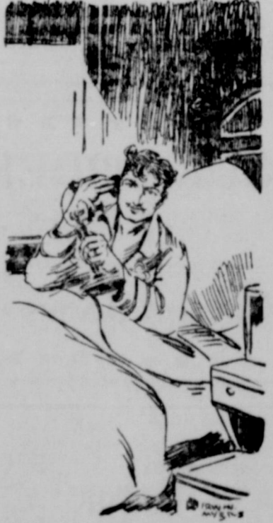
'No," He Said, "I've Been Awake Some Time."

His telephone tinkled at his ear Turning on his elbow he took the in