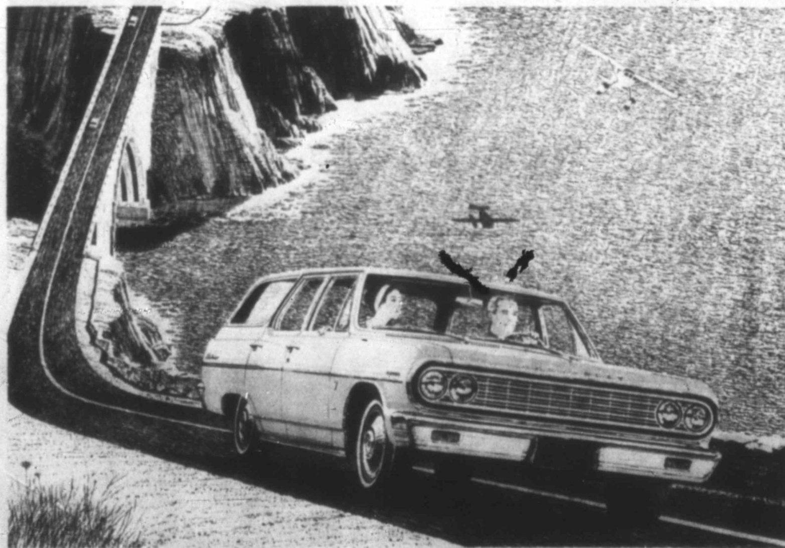
Chevelle Malibu 6-Passenger Station Wagon

CHECK THE T-N-T DEALS ON CHEVROLET • CHEVELLE • CHEVY II • CORVAIR AND CORVETTE NOW AT YOUR CHEVROLET DEALER'S