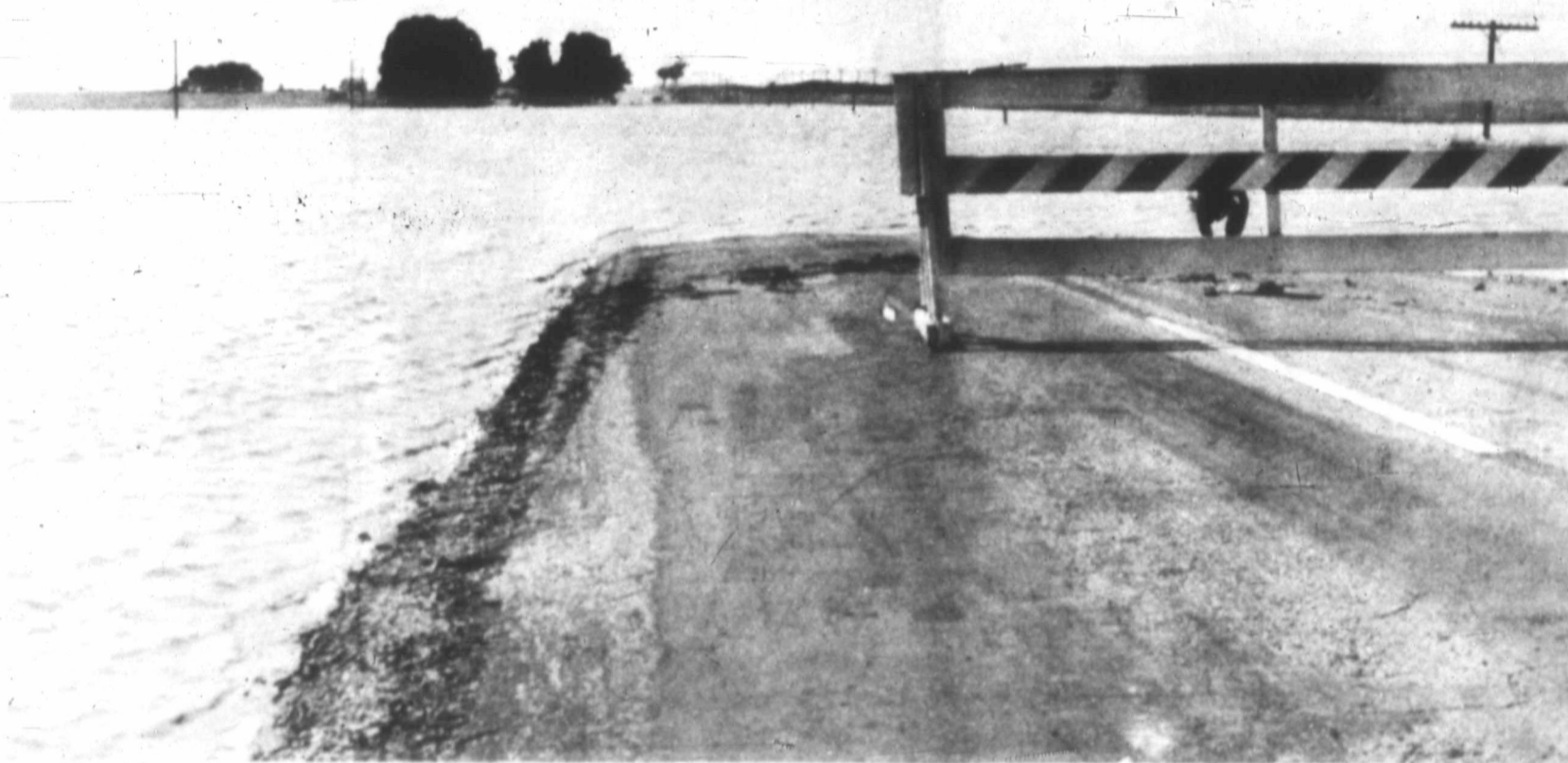
MAN THE PUMPS — This highly publicized section of U.S. Hwy. 84 became a fair-sized lake last weekend and halted traffic on the highway for an indefinite period. Rains last Thursday, Friday and Saturday in the area totaled from three to eight inches, with the biggest single rainfall Friday. Most cotton in the region was washed out, and farmers already were replanting this week as soon as they could get in the fields. Some fields and this part of the highway remained under water. Traffic was being routed around the quarter-mile-wide lake.

Sometimes I even read those stories not particularly related to