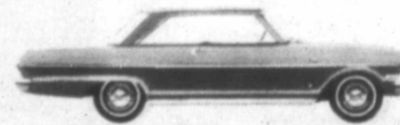
Chevy II Nova Sport Coupe