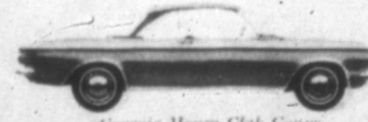
Corvair Monza Club Coupe