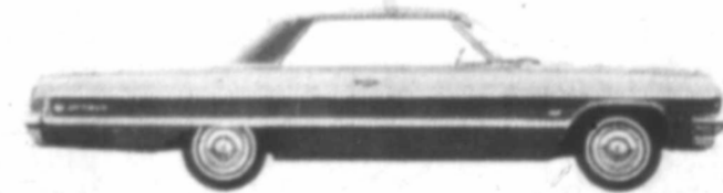
Chevrolet Impala Sport Coupe

Chevrolet has always been a favorite car. Now it's more in favor than ever! Just drop by your Chevrolet dealer's to see why. Look at his wide assortment of brand-new Chevrolets, Chevelles, Chevy II's and Corvairs. Pick the one you want—then join all those smart buyers who got a number one deal on the number one seller. But don't wait too long; there are a lot of other smart buyers around!