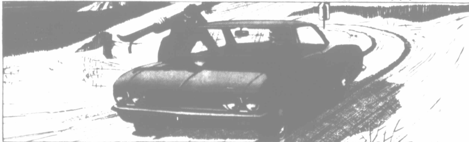
CORVAIR—The only rear engine American car made. Corvair, Corsa Sport Coupe

When you take in everything, there's more room inside this car than in any Chevrolet as far back as they go. It's wider this year and the attractively curved windows help to give you more shoulder room. The engine's been