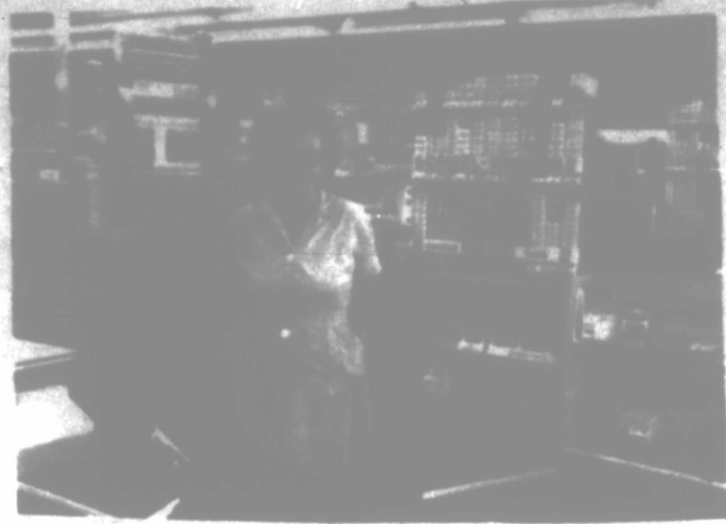
PRICES GOOD FRIDAY AND SATURDAY