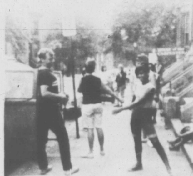
LEAVING FOR SWIMMING - Shown above is a group leaving from "Southend" in Boston for a swimming outing.