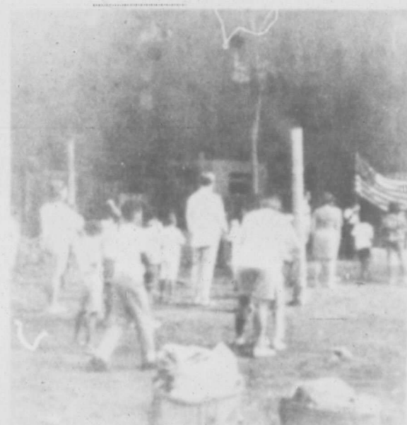
PLEDGE OF ALLEGIANCE - The underprivileged children of South Boston take part in a presentation of flag service.

SUDAN BEACON-NEWS THURSDAY, SEPTEMBER 8, 1966