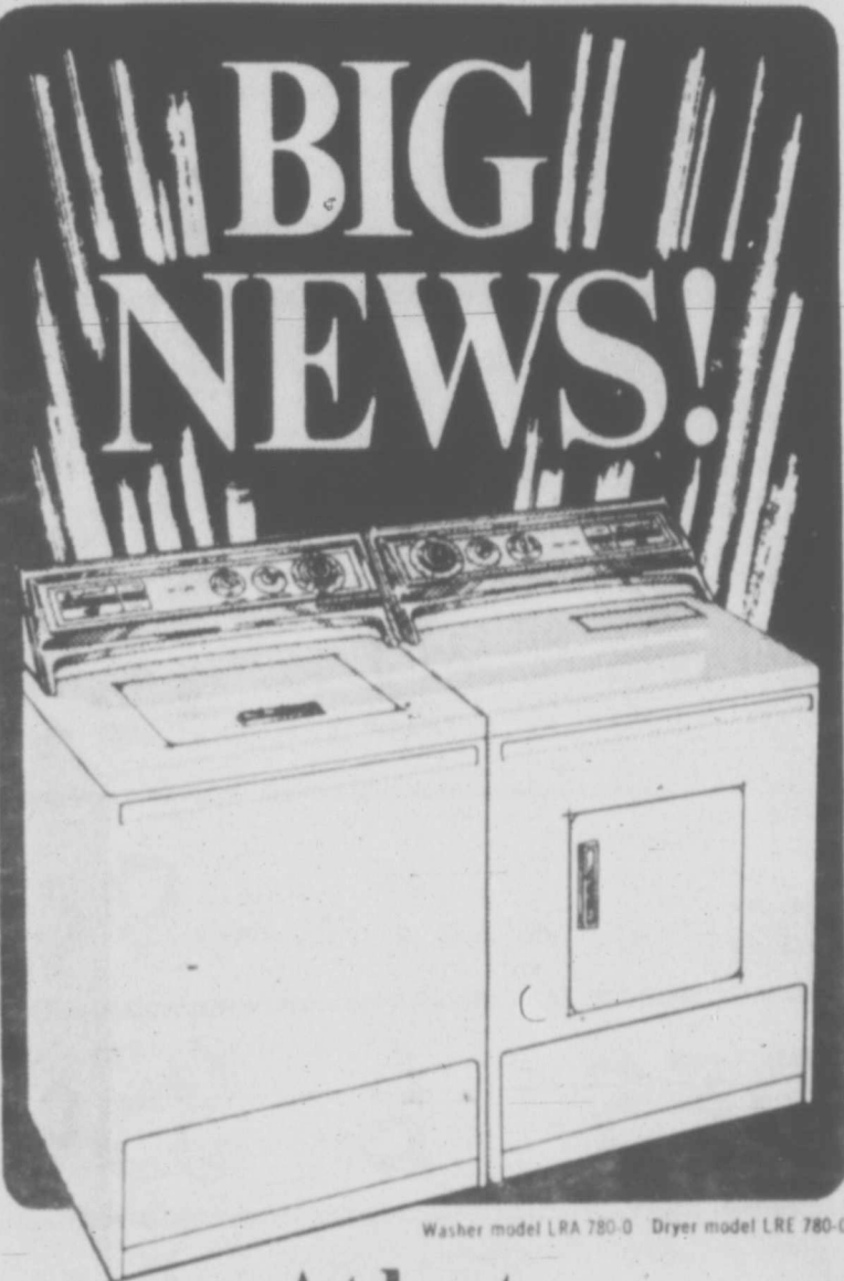
Washer model LRA 780-D Dryer model LRE 780-D

THIS WOULD MAKE A PERFECT GIFT FOR CHRISTMAS