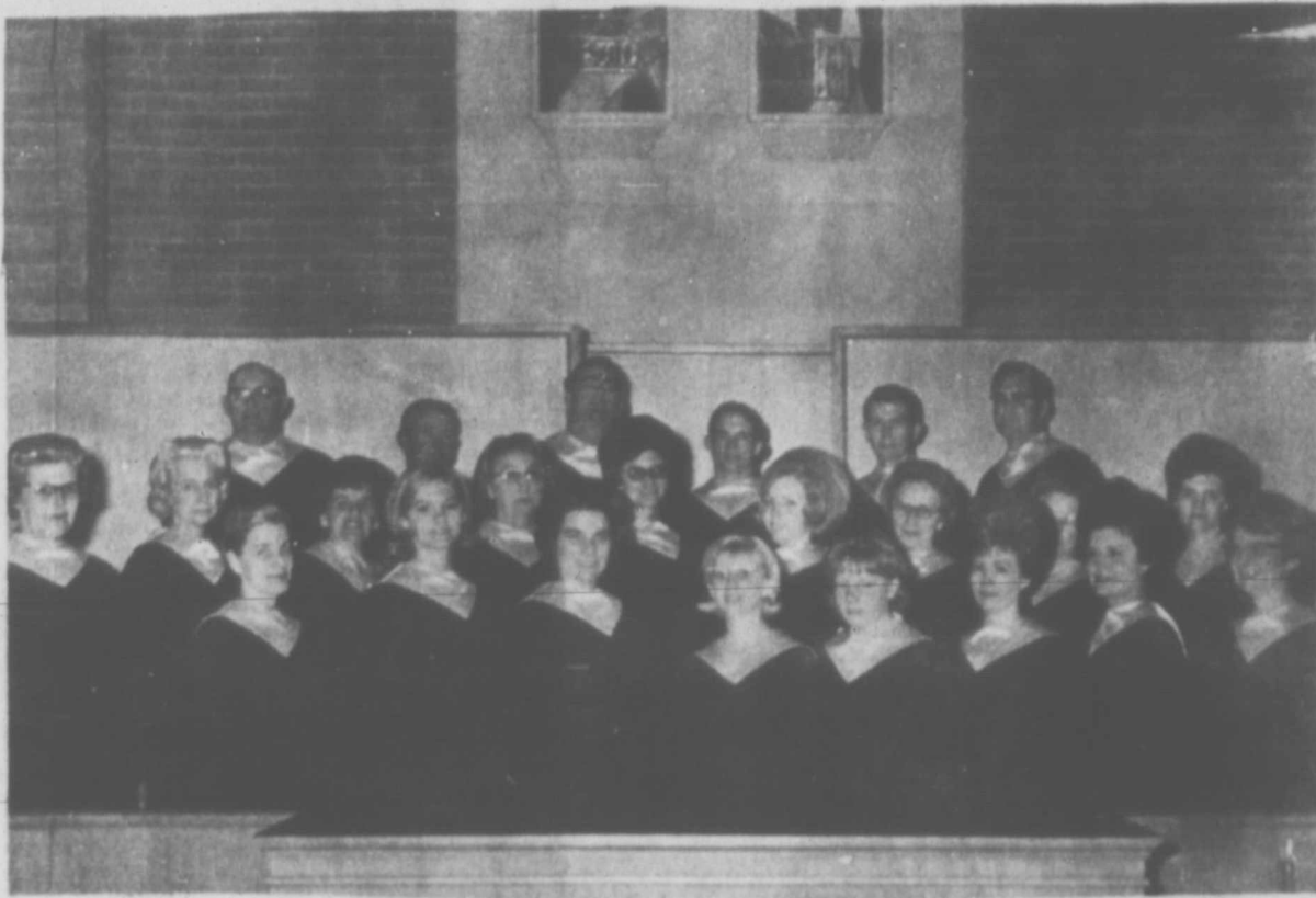
CANTATA CHOIR - Shown above are members of the choir which will present the Christmas cantata "Song of Songs" Sunday, Dec. 18, at 5 p.m. in the First Methodist Church.

Everyone is invited to come and start this season by hearing the Christmas Story in song.