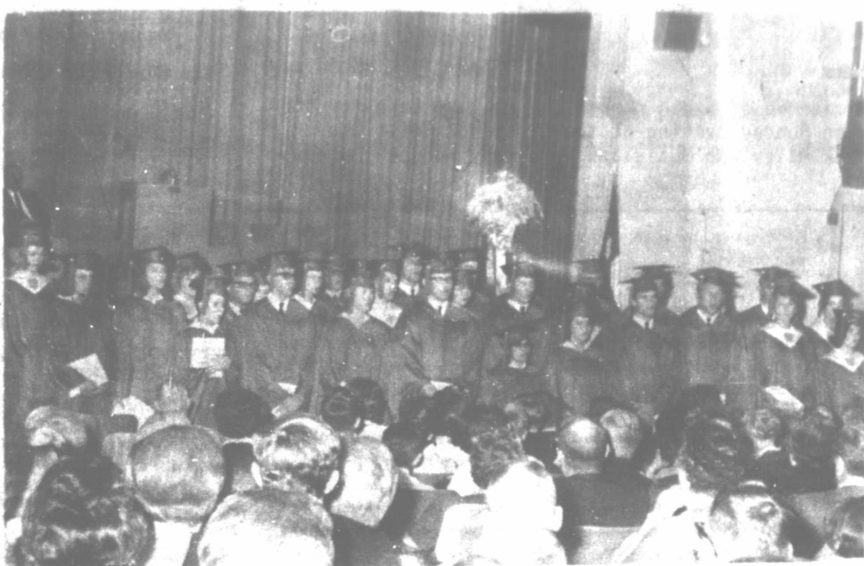
CLASS OF '67 - Shown above are the 34 seniors of Sudan High School who received diplomas during Commencement held Monday night in the High School auditorium. Baccalaureate services were held Sunday night in the First Methodist Church.