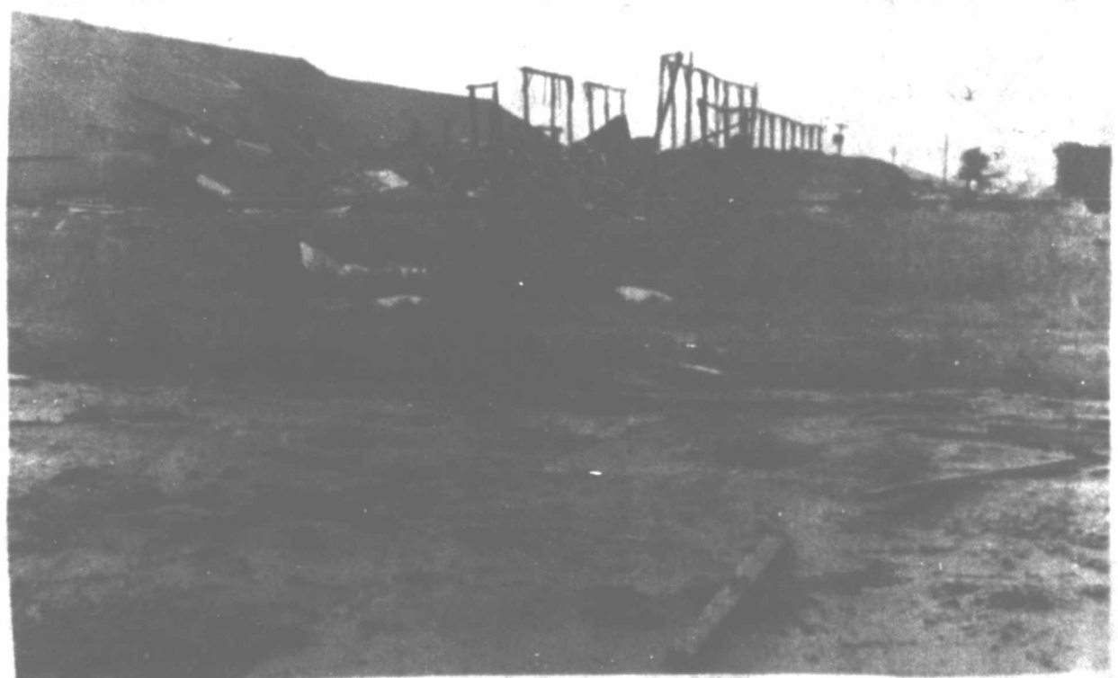
DEMOLISHED WAREHOUSE - Shown above are the remains of a warehouse at Central Compress, which was destroyed during the storm here Sunday night. Debris from the building was scattered over a large area.

The extent of damage to area crops was not certain at press time but it is expected to be severe in some areas south of town.