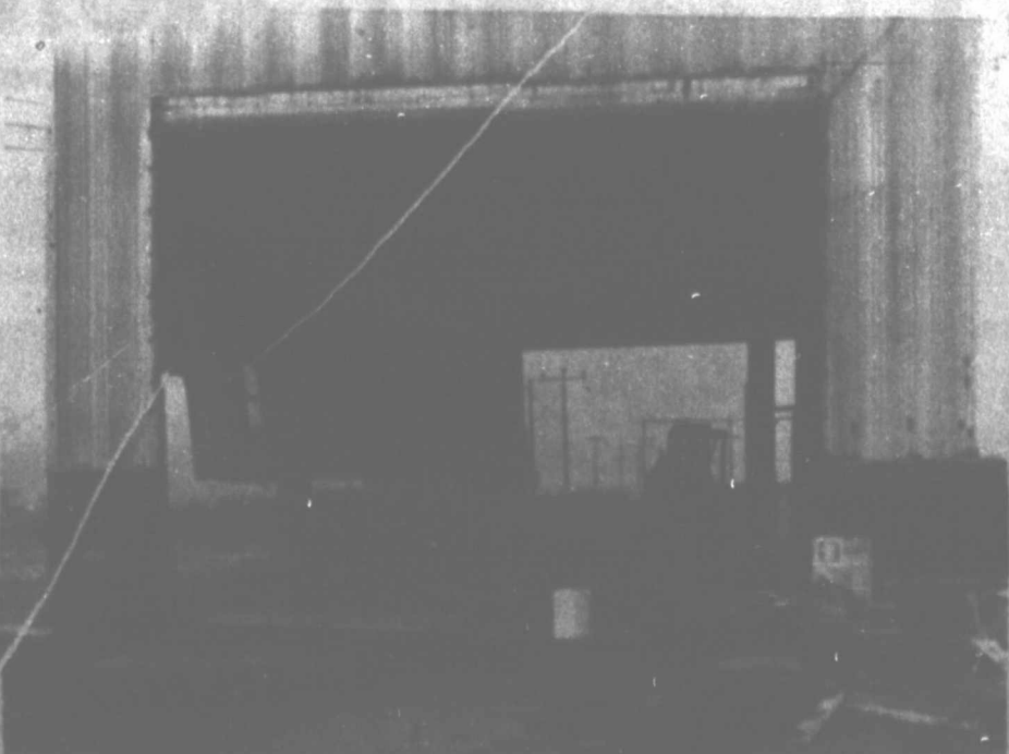
OTHER STORM PHOTOS - The photo to the left was taken at Nix & Grigsby Delinting Plant west of town. The cement block and sheet iron building received considerable damage. The center photo shows