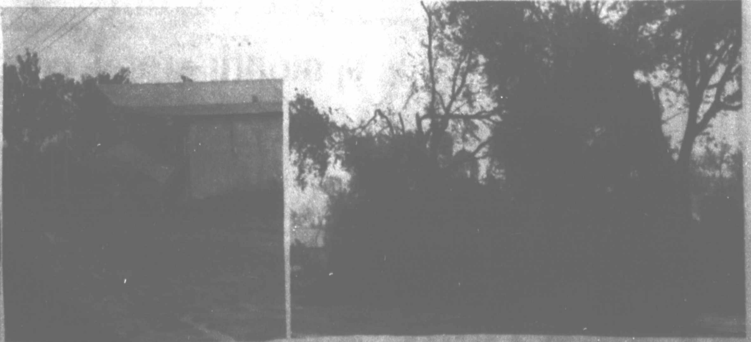
which was torn from the Garcia Cafe. At the right is a photo showing some of the damage done to trees. There are reports of several trees