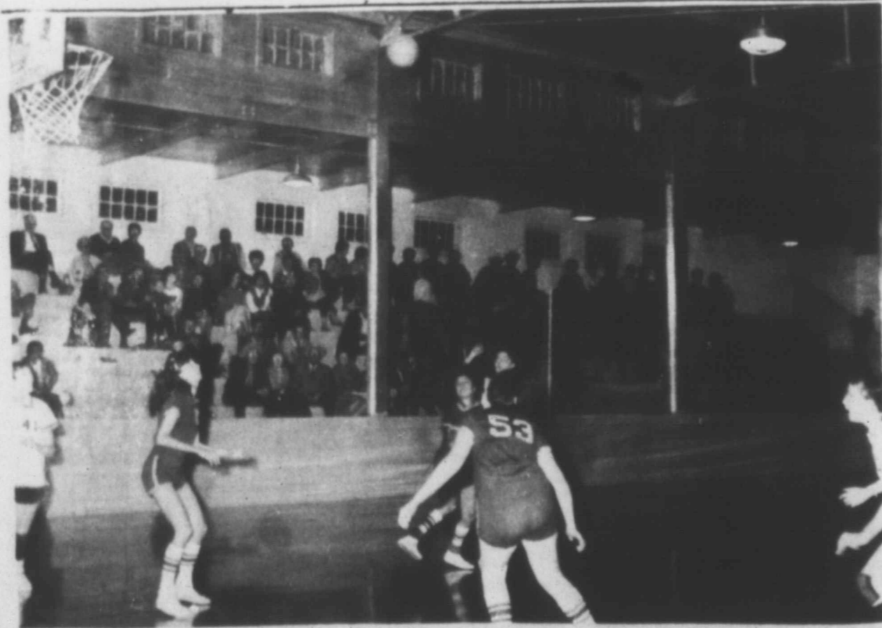
ROUND BALL -- Shown above is a scene from the Sudan-Amherst girl's basketball game Tuesday night in Amherst, when the Hornette's won 49-27.