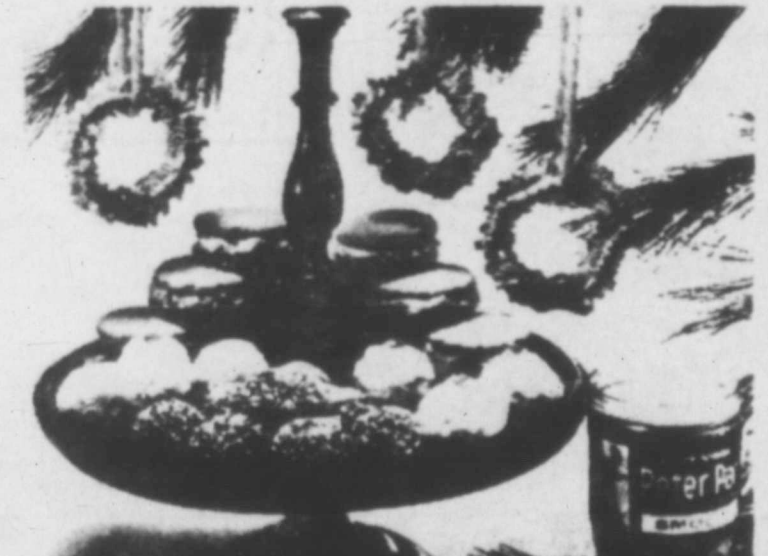
Peter Pan Peanut Butter Photo

Deck the house with festive cookies. And make them all from one basic recipe. Here's a fun, peanut butter cookie created in the kitchens of Peter Pan that takes minutes to prepare and gives a holiday full of pleasure.