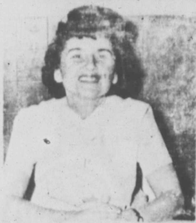
By HAZEL HOUSE

Scripture: Proverbs 30: 5; St. John 1: 1; Genesis 9: 11-17.