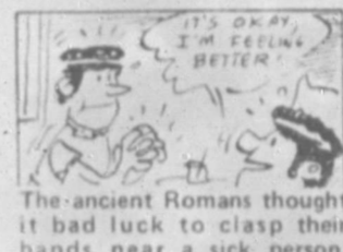
The ancient Romans thought it bad luck to clasp their hands near a sick person.