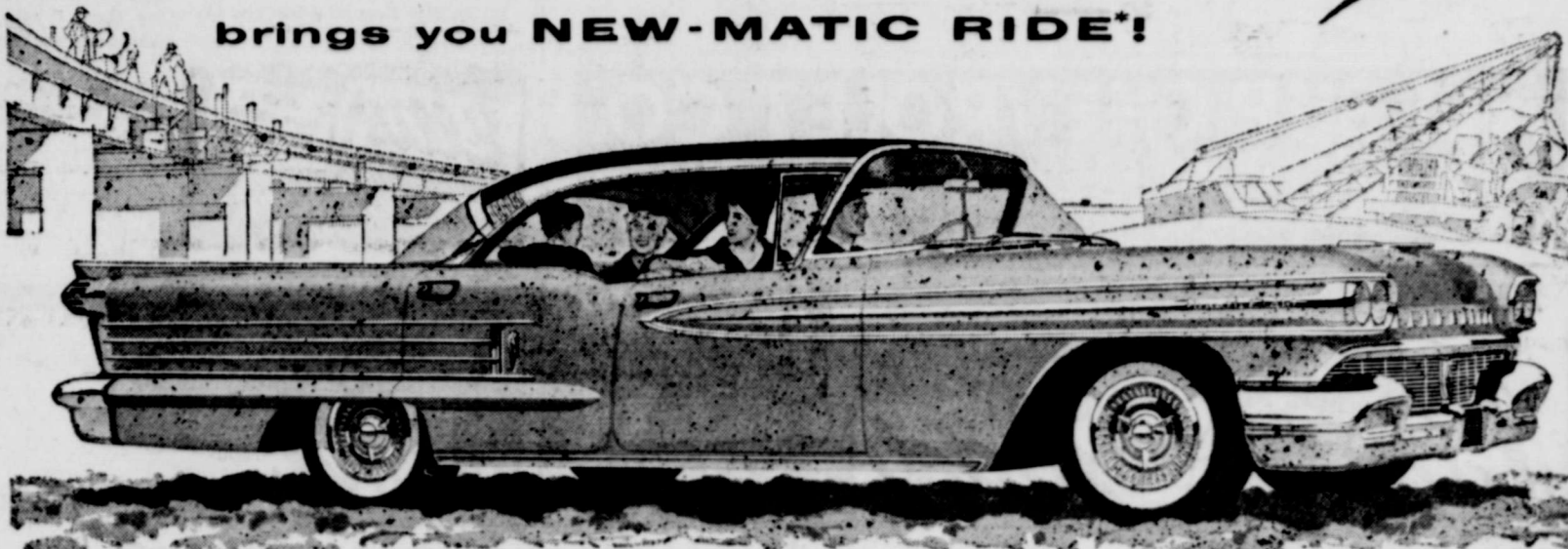
All '58 Oldsmobiles feature Safety Plate Glass ... all around! You don't have to look twice to tell it's a '58!