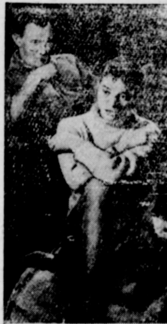
SHOWING Wednesday and Thursday at the Rose Theatre, Morton, "Stowaway Girl" starring Trevor Howard, Pedro Armendariz, and Elsa Martinelli.