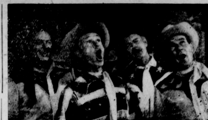
Shown are a group of familiar faces in the 1957 - 58 John Deere Day Show — a scene from the western movie "The Ace Ranchero."

The movie will show this afternoon, at 1 p.m. in the auditorium as part of the all day program sponsored by McAllister - Huggins.