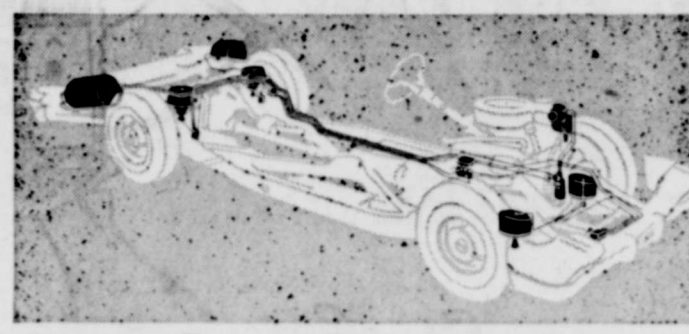
For the finest performance, Oldsmobile's New-Matic Ride is an exclusive "closed-system" (shown above). Carefully-filtered air is pumped into high-pressure tank (behind right rear wheel, ready for instant use as air chambers (at wheels) require. Air then circulates to low-pressure air bags (behind left rear wheel), ready for future use. Air springs (one at each wheel) replace conventional metal springs.