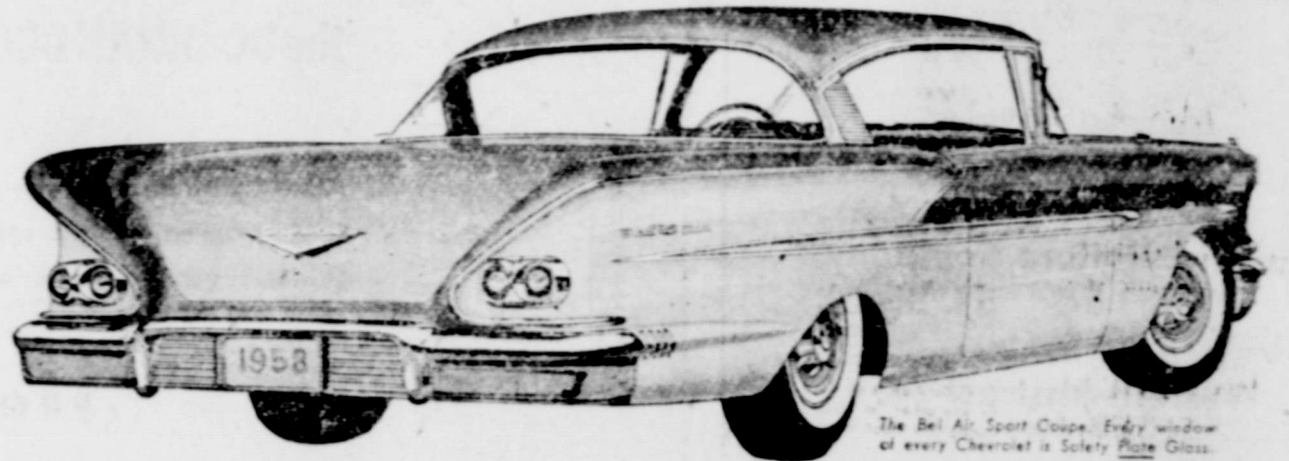
The Bel Air Sport Coupe. Every window of every Chevrolet is Safety Plate Glass.

See your local authorized Chevrolet dealer for quick appraisal—prompt delivery!