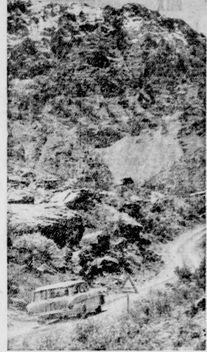
The sure-footed Chevrolet purrs past a road sign that says, "danger" — and ahead lies the toughest part of the perilous Andean climb.

So the run began — across the blazing Argentine pampas, into the ramparts of the forbidding Andes. Up and up the road climbed, almost 2 1/2 miles in the sky! Drivers gasped for oxygen at 12,572 feet — but the Turbo-Thrust V8 never slackened its torrent of power, the Full Coil springs smothered every bump, the Turboglide transmission made play of grades up to 30 percent. Then a plunge to the Pacific at Valparaiso, Chile, a quick turn-around and back again. Time for the round trip: 41 hours 14 minutes — and the engine was never turned off!