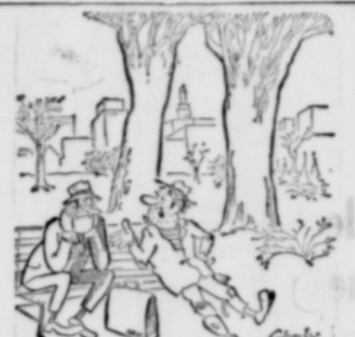
"Well, try your pitch on me—maybe I can spot where your weaknesses lie."

Members discussed plans for making Family trees as a program.