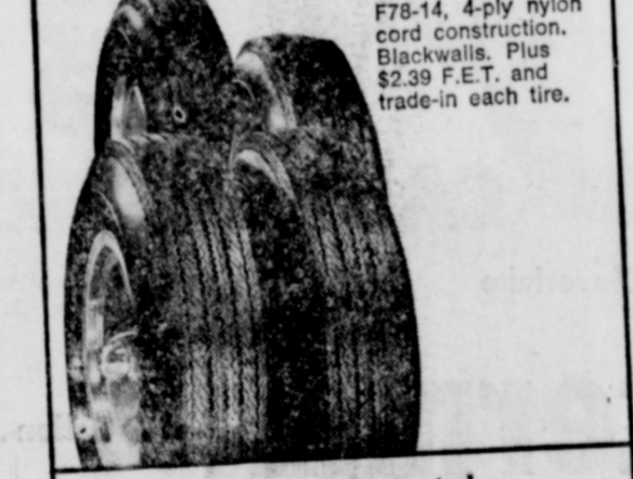
F78-14, 4-ply nylon cord construction. Blackwalls. Plus $2.39 F.E.T. and trade-in each tire.