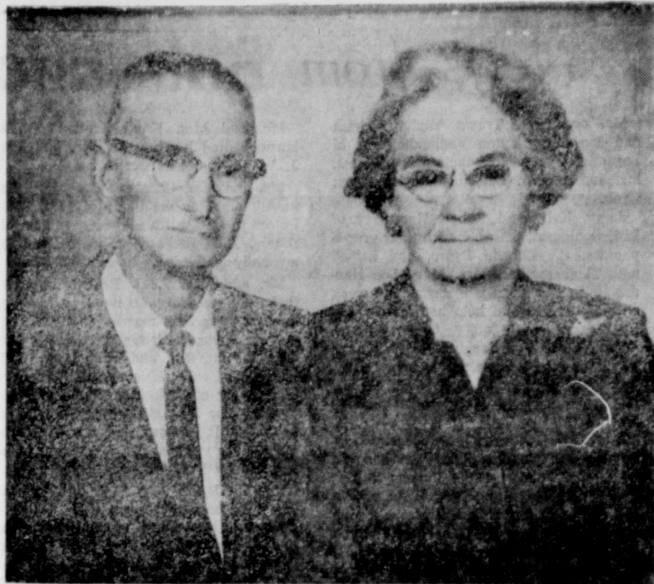
60th WEDDING ANNIVERSARY . . .