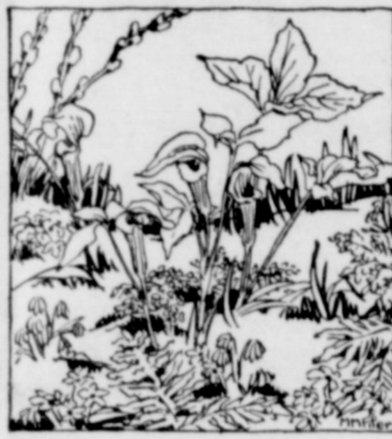
The Flowers Burst into Bloom.

story before we both leave each other entirely.