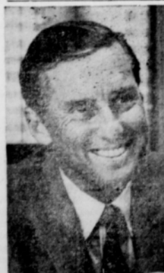
Bentsen Senator for the Seventies.