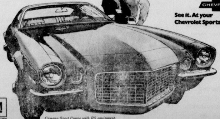
Camaro Sport Coupe with RS equipment.