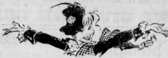
Bonnie, the Plaid Lassie®

10 Years Experience ANTENNA INSTALLATION School Trained in both Color and Black & White T.V. Repair Also repair Stereos, Radios, and Tape Decks 101 Hunt Clyde (South FM 604) 893-4242