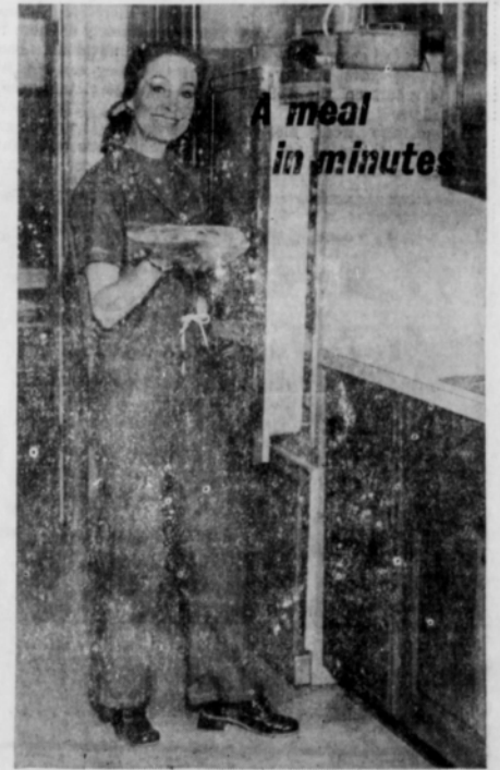
A meal in minutes