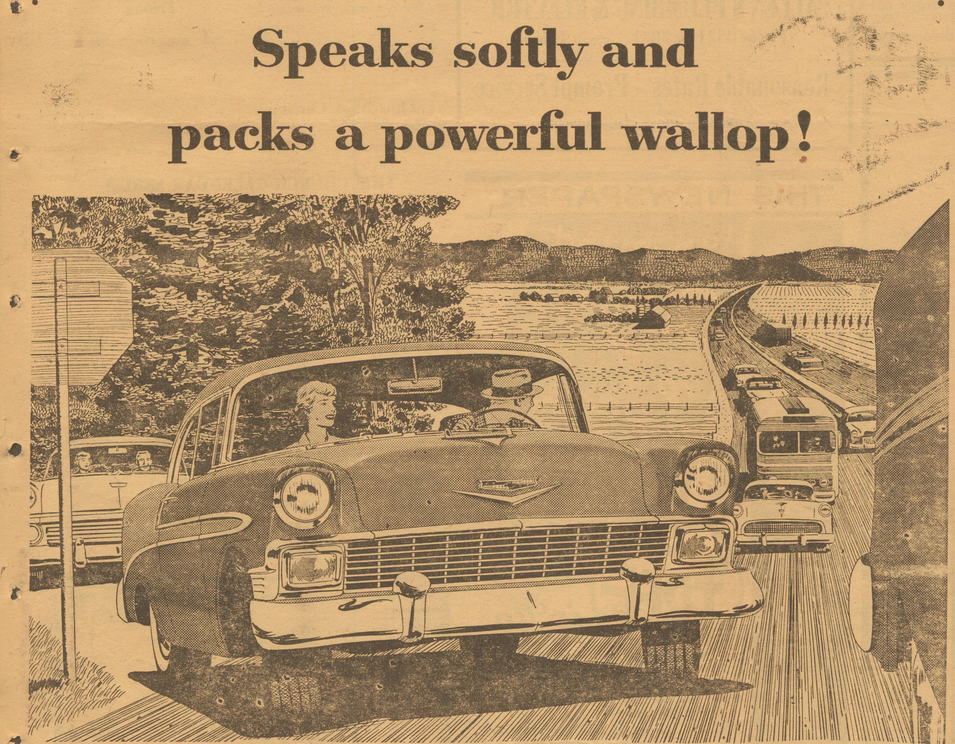
THE BEL AIR SPORT COUPE-one of 19 high-priced-looking Chevrolets, all with Body by Fisher.

High Plains Underground Water Conservation District No. 1