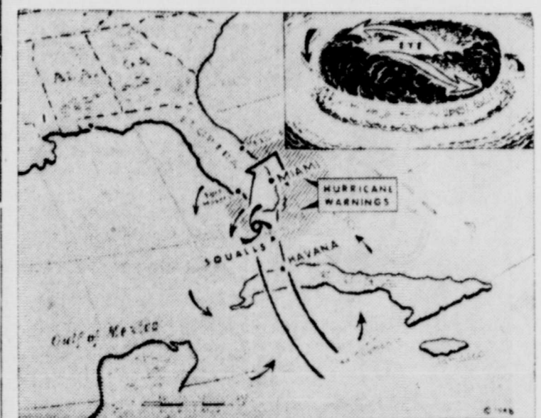
This map shows the path taken by the hurricane which swept over Cuba and the Florida keys. Estimates of the damage have not been determined.

nice bassinet filled with useful and pretty gifts. The gift packages were opened and the gifts passed for inspection.