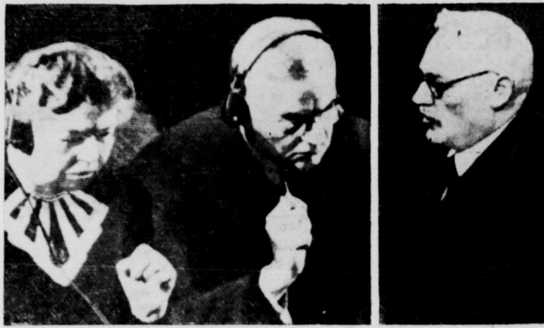
Tight-lipped American UN delegates Eleanor Roosevelt and John Foster Dulles listen while Russia's delegate Andrei Vishinsky accuses the U. S. of preparing an atomic war against the Soviet. Vishinsky made the charge before the UN General Assembly in Paris. The slashing anti-U. S. attack was the latest in a series of blasts by Russia, claiming the U. S. is war mongering.