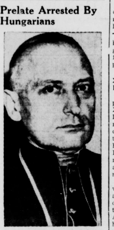
Joseph Cardinal Mindszenty, Roman Catholic prelate and Chief clerical foe of the Communist Hungarian government, has been arrested by Hungarian police, radio Budapest has announced.

Prelate Arrested by Hungarians Joseph Cardinal Mindszenty, Roman Catholic prelate and Chief clerical foe of the Communist Hungarian government, has been arrested by Hungarian police, radio Budapest has announced.