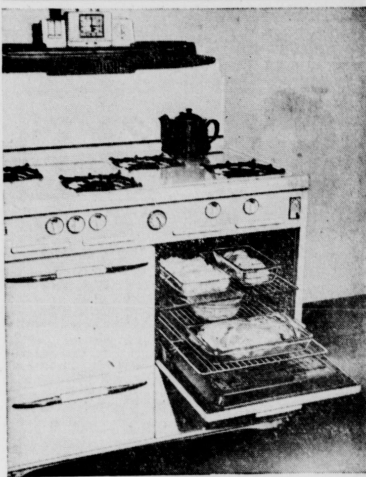
This entire oven meal of three courses cooks while the homemaker is out of the kitchen. The clock automatically turns the gas on at the time set by the homemaker before she leaves and turns it off when meal is done. Menu includes soup, lamb, sweet potatoes, apple crisp.

past three years and three months working in the Mica-film department of the Lettman General hospital.