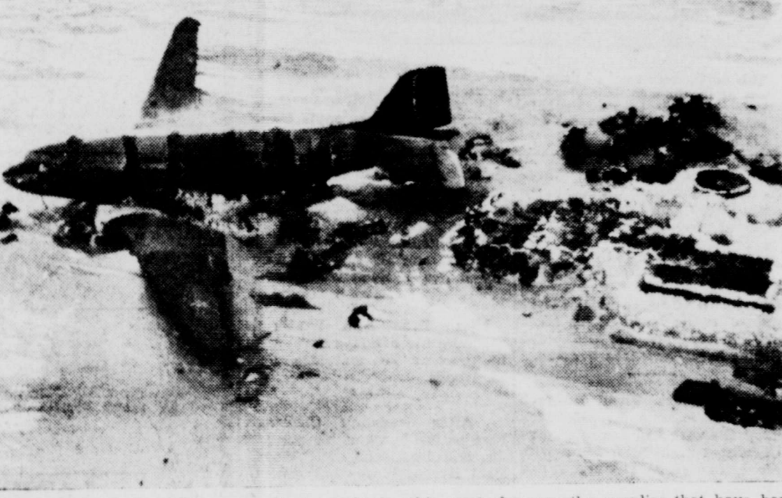
The downed C-47 and its seven crewmen that have been marooned on this ice cap in Greenland since December 9 will probably be right in this spot for Christmas. At the rear of the plane is the ice dug-out or igloo that the airmen built. Also shown are the supplies that have been dropped to them.

bought by friends attending and gifts were also sent by several friends who were unable to be present.