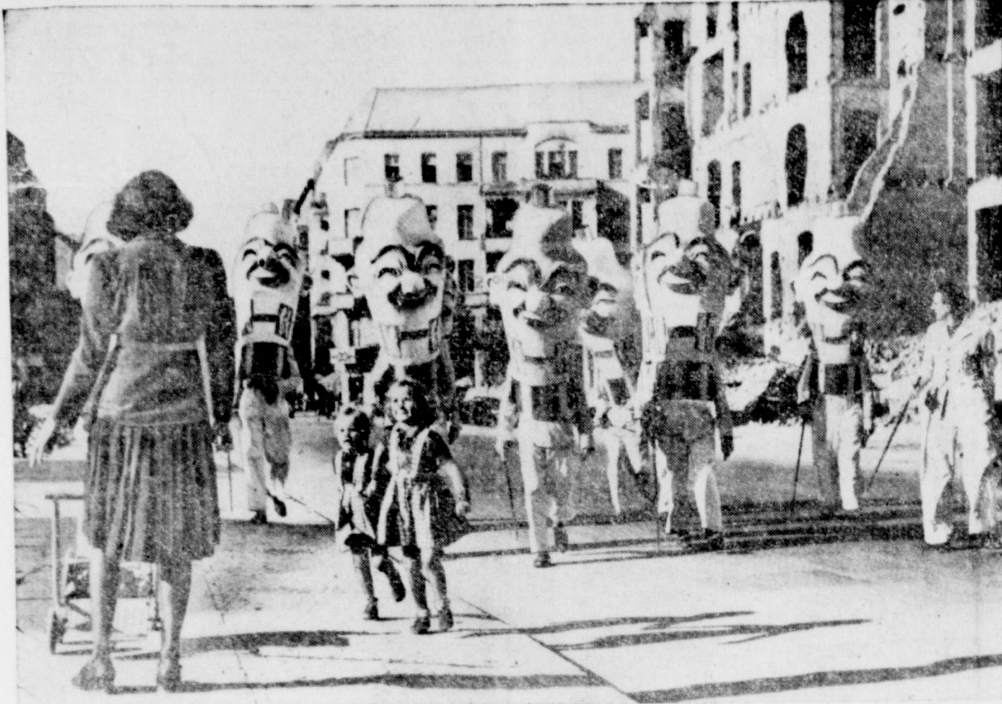
WALKING ADVERTISEMENTS—These grinning two-legged radio tubes provide something new in the advertising business in Berlin, Germany. They were used by a store to attract customers, but they seem to frighten the two youngsters who are running to mother.