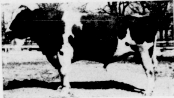
HOMER PIETERERTJE BOSCH LAD 835403

Since food is the controlling factor in the growth of fish it is felt that this work is necessary to improve the fishing in Lake Cisco. After the job is complete it is planned to restock the lake with the type of fish that can keep down the shad and carp population. This will make the fishing better and give the small ones a chance to be big ones when you catch them.